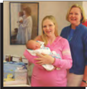
First Baby of 2009 - Page 10