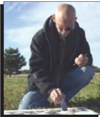
Art Show at Thunderbird Gallery - Pages 12-13