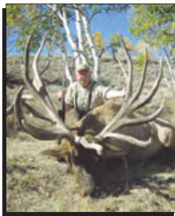
World Record Elk - Page 18